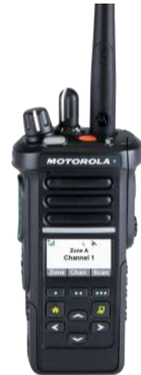
APX 4000 (2 Knobs) Model 2 Quick Reference Card